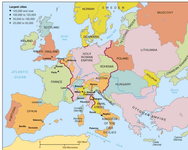
Largest Cities in Western Europe, ca. 1500. There were as many large cities in the Italian peninsula as in all of the rest of western Europe.